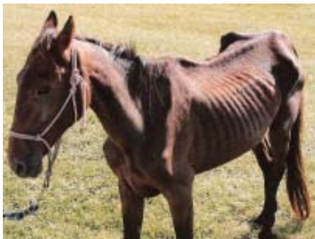
Sam - October 14, 2006