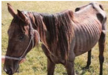
Nona - October 14, 2006