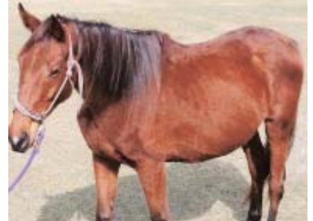
Nona - December 14, 2006