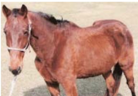
Sam - December 14, 2006