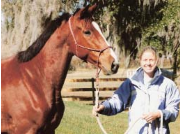
April and Boomer