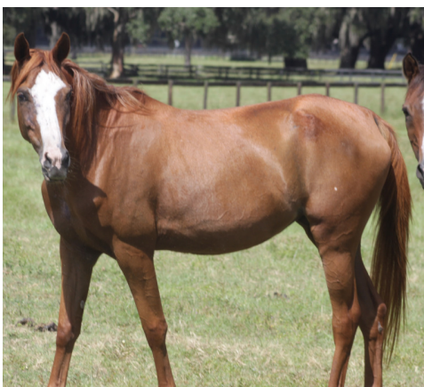
Chanel October 10, 2013