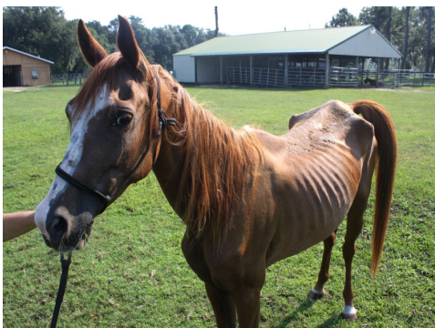
Chanel August 5, 2013