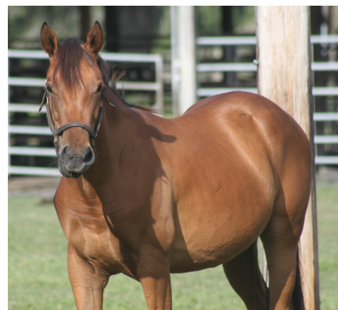
LucyLu August 9, 2013