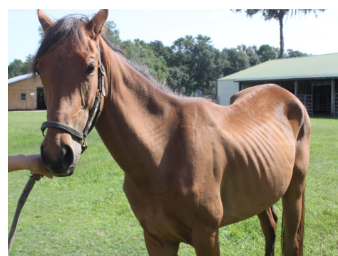
LucyLu July 3, 2013