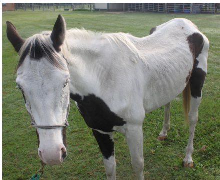
Sky June 11, 2013