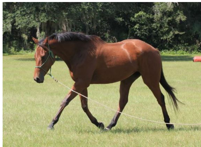
Mac 5 year old Thoroughbred