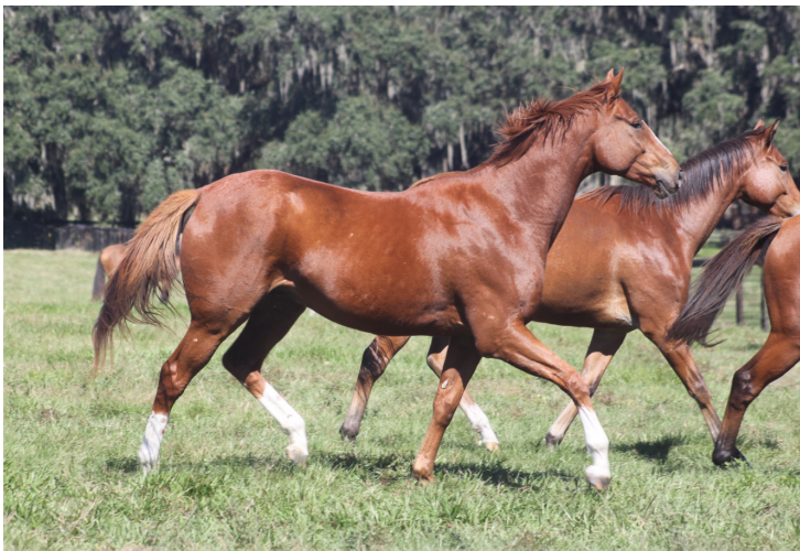
Flash 5 year old Thoroughbred