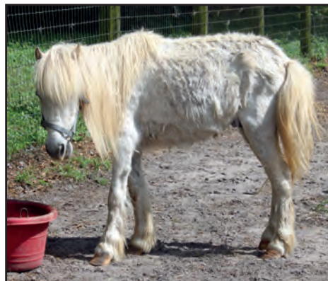
Before Silver 4-29-15