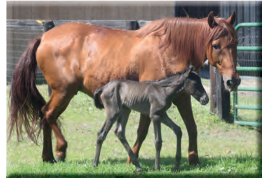
Engreida & Sunday 3-8-15