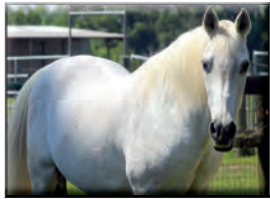
Prince Edward age 31