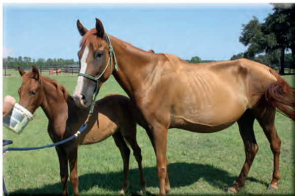
Bri 6-19-15 730 Pounds 123 Pounds gain in 30 days

After 9 days here, she nickered to us for the first time as we brought her feed in to her. Bri has been eating as much alfalfa, peanut and coastal hay and grass as she wants, along with 4.5 pounds of Purina Senior concentrate at 5 am, 10 am, 4 pm and 10 pm. In two weeks Bri gained 72 pounds, Tommy gained 94 pounds and Madonna gained 73 pounds. The filly is completely