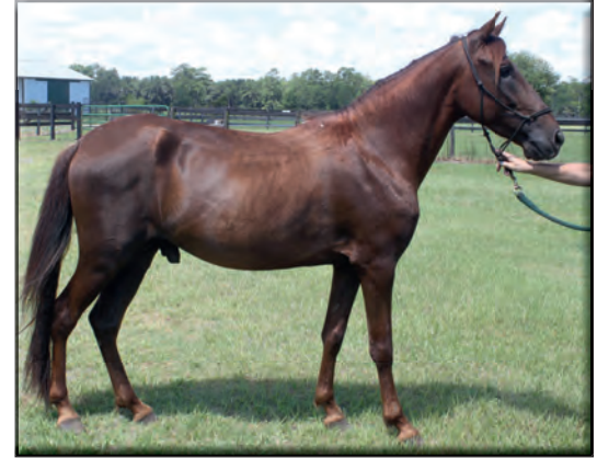
Tomequen 627 Pounds 112 Pounds in 28 days

food. They could not even see that the horses were starving to death before their very eyes.