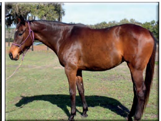
After Tasha 3-8-15