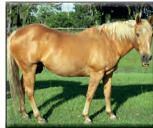
Shirl age 32