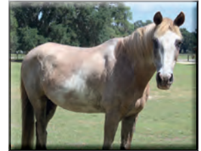
Buttercup age 25

Volunteers are regularly needed at the farm for feeding, grooming, cleaning and 101 other things