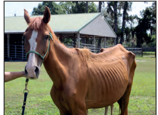
Bri 5-21-15 607 Pounds

Bri follows Momma and Sunday in and out of the barn and into her stall at feeding time.