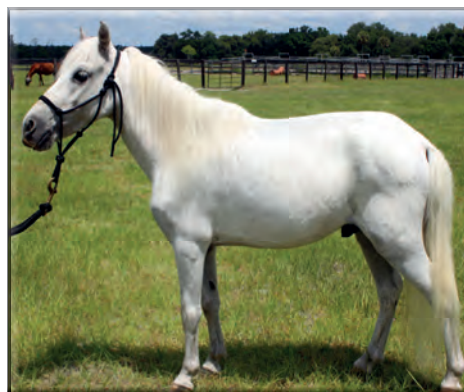
After Silver 5-18-15