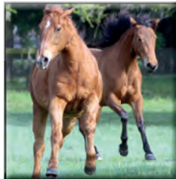
Legacy age 30