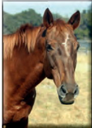
Polo age 24