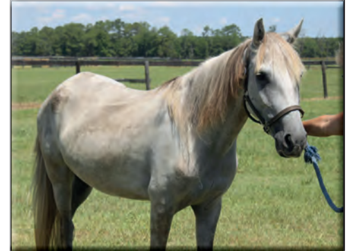
Madonna 6-19-15 645 Pounds 120 pounds in 28 days

pen to give all four their grain the first day Madonna panicked and tried to go over the fence which made the other three follow her as they got scared because she was so panicked. This reaction came from one person slowly, quietly walking 100 feet away to place their grain into their feed tubs. All are gradually beginning to trust us but it will take some time for them to overcome their fear of people.