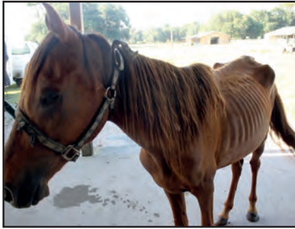
Tomequen 515 Pounds

food. They could not even see that the horses were starving to death before their very eyes.