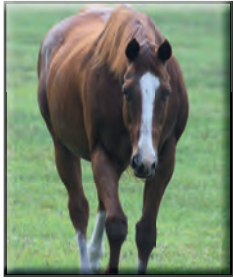
Destiny age 24