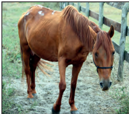
Before Engreida 11-24-14