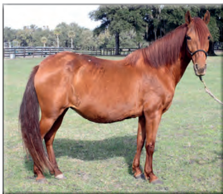
After Engreida 1-1-15