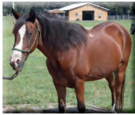
Pookie age 28