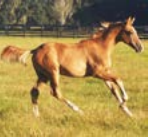
Dixie and Poco