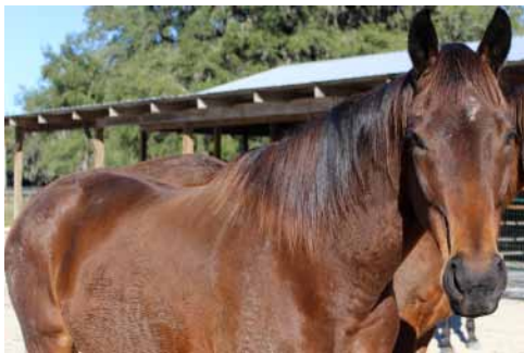
Texas, 14 year old TB