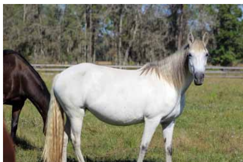
Zania, 10 year old Paso Fino