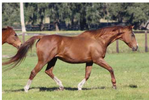
Destiny, 18 year old TB