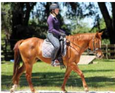
Tinkerbell, 3 yearold Lg Pony