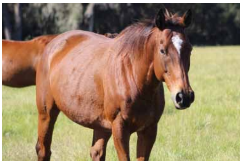
Rosie, 13 year old TB