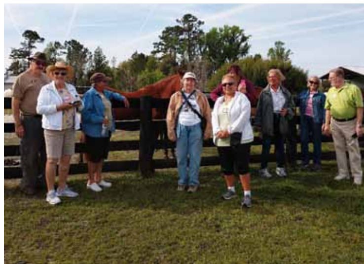
Horsin Around Club from The Villages Visit to Farm