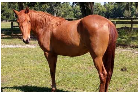
Vogue, 5 year old Paso Fino