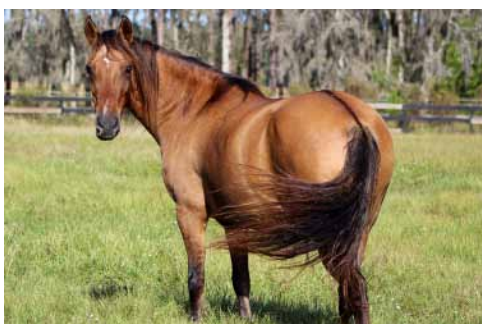
Lola, 10 year old Paso Fino