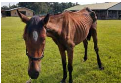
Phoebe July 2018