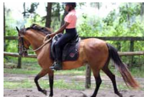
Sunshine, 9 yearold Paso Fino