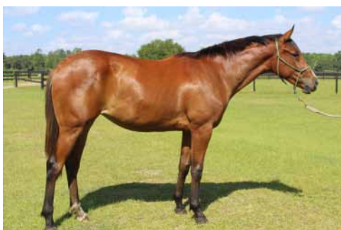
Emma, 2 year old TB