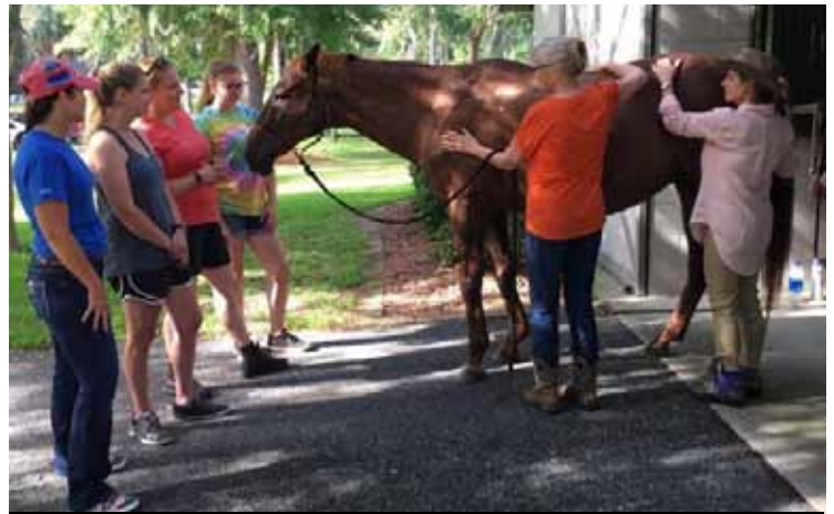
Equine Align Academy June 2019

I was invited to Wellington, Florida by a student and spent three winters working and teaching there. I fell in love with Florida and ten years later, finally made the move from Northern New Mexico to Ocala at the urging of another friend.