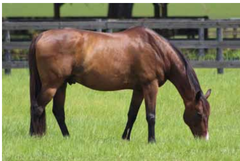
Music, 15 year old TB