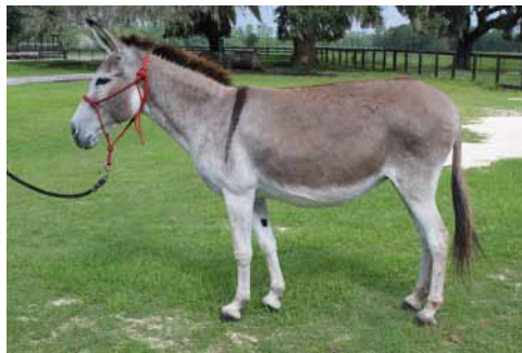
Willow, Aged Donkey