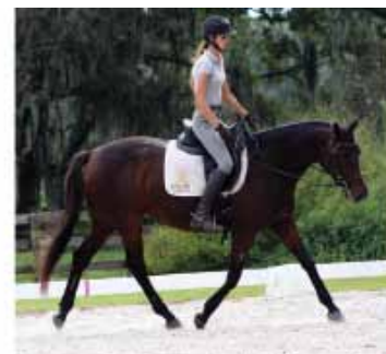
Athena, 10 year old TB