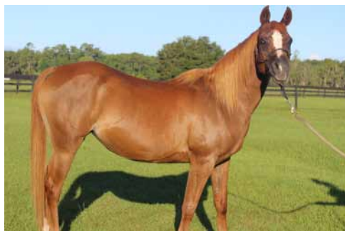
April, 19 year old Arab