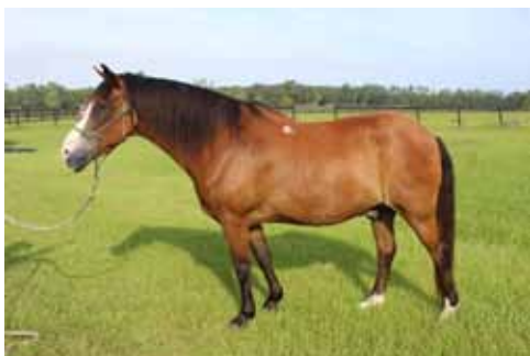
Pookie, 32 year old Paso Fino