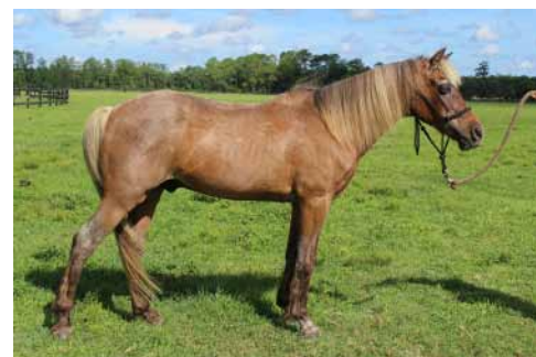
Ponyman, 30 years old