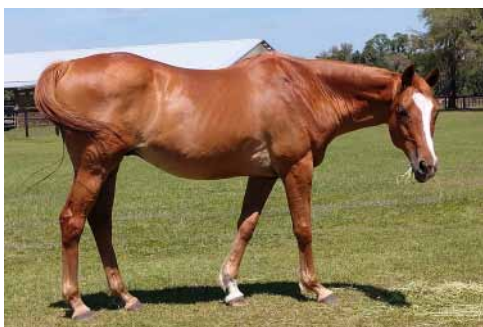
Frankie, 20 year old TB