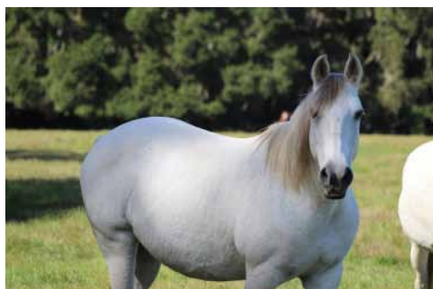
Karma, 19 year old Large Pony