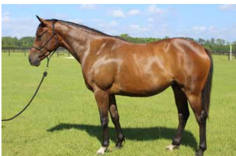
Phoebe May 2019