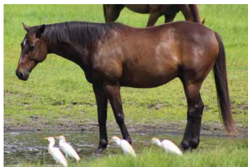
Dempsey, 13 year old TB