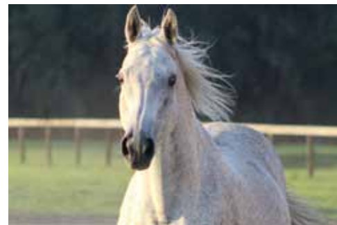
Sammy 17 year old TB