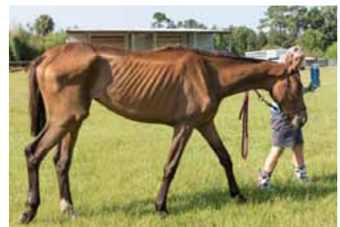
Monica July 2018