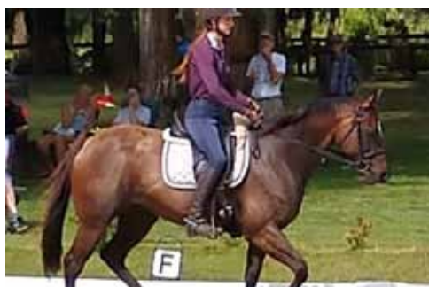
Shadow, 9 year old TB