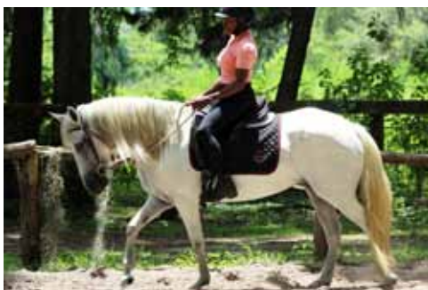
Abbey, 10 year old Paso Fino