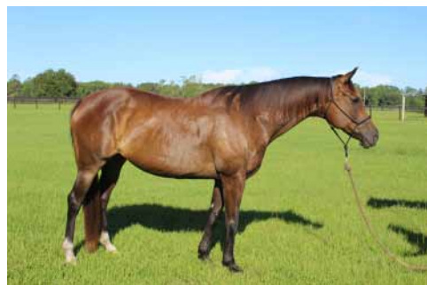
Bonnie, 10 year old TB