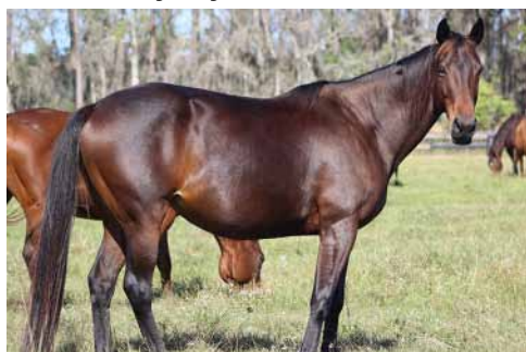
Trixie, 10 year old TB