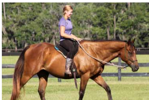
Buzzy 14 year old TB