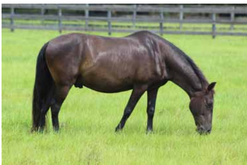
Hermoso, 9 year old Paso Fino