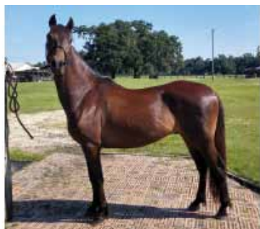
Amigo, 12 year old Paso Fino