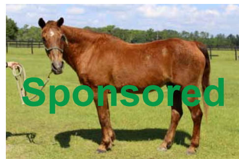
Legacy, 34 year old QH