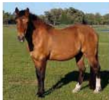
Cupido, 20 year old Paso Fino