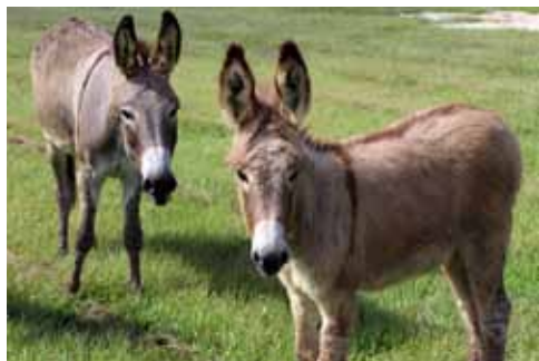
Samson, 4yr and Sparky, 1yr