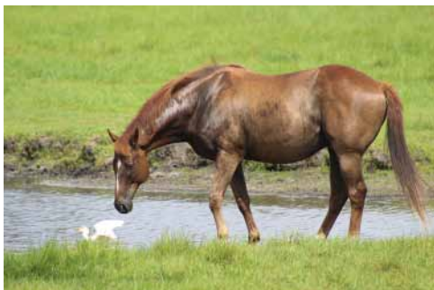
Brando, 10 year old TB