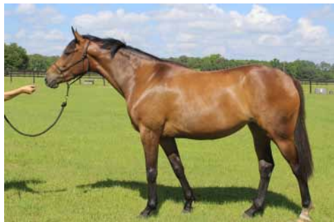
Monica, 3 year old TB