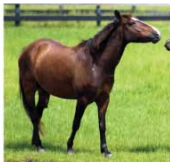
Perry, 7 year old Large Pony