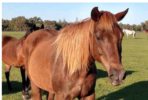
Spiff, Aged QH