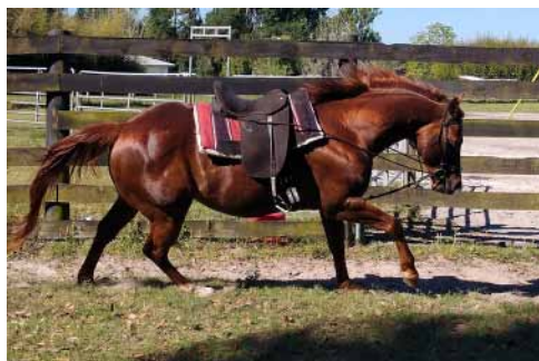
Blake, 17 year old QH