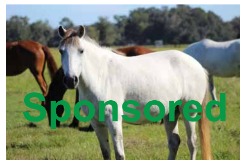
Fancy, 7 year old Paso Fino