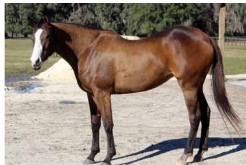
Peggy, 4 year old TB