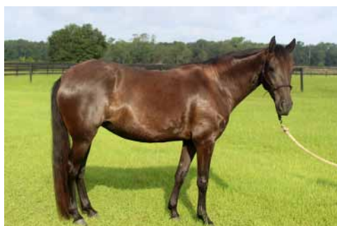
Sunday, 4 year old Paso Fino