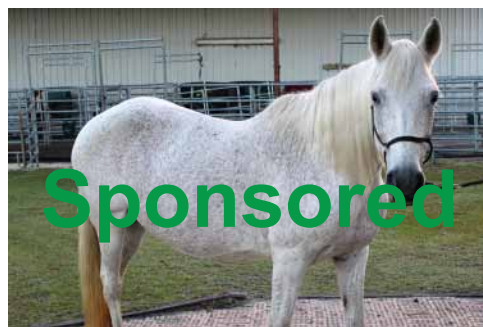
Hope, 19 year old Paso Fino