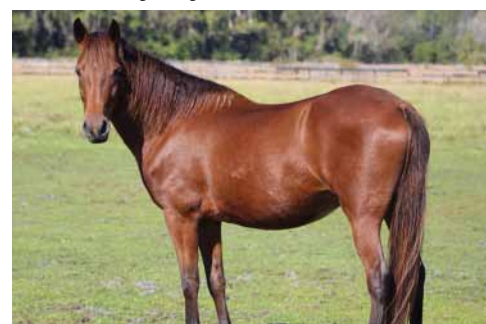
Roxy, 5 year old Paso Fino