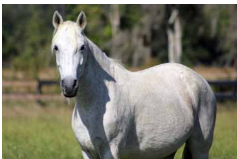
Monet, 14 year old Paso Fino