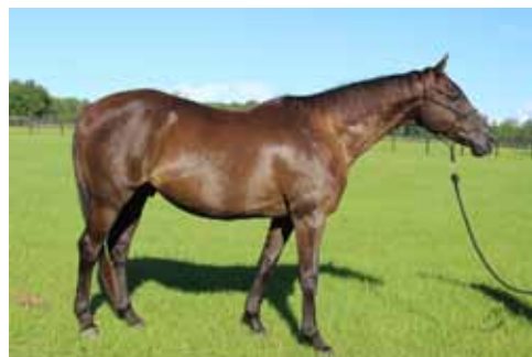
MooMoo, 20 year old TB