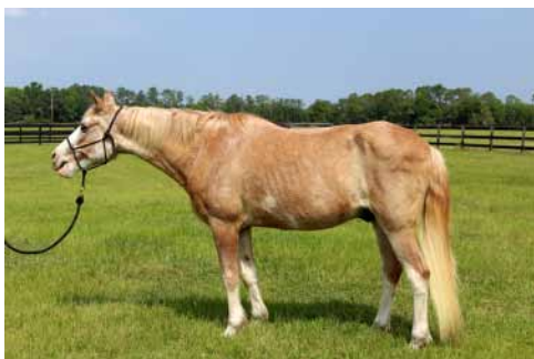
Buttercup, 29 years old