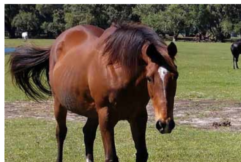
Sunny, 23 year old TB