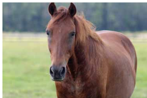
Tommy, 10 year old Paso Fino