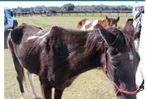
Rhett December 18, 2019