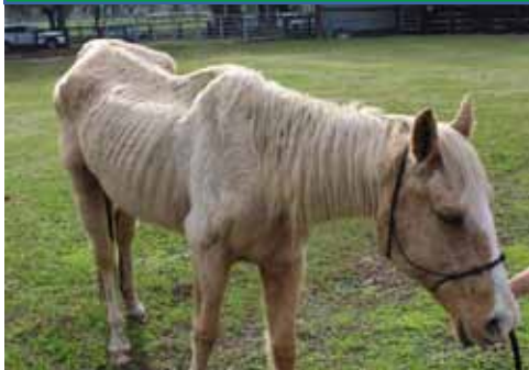
Majestic February 20,2020