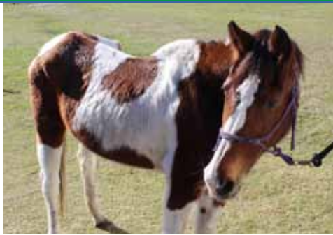
Madame December 18, 2019