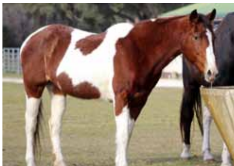
Madame February 1,2020