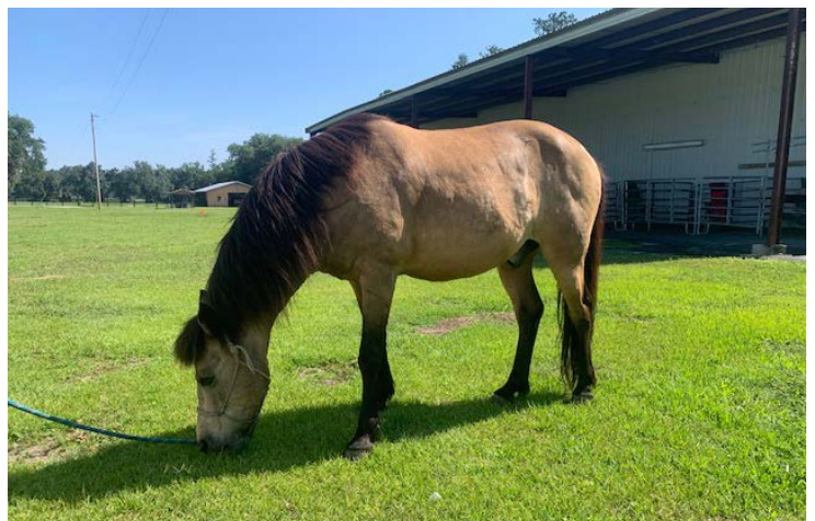
Valentino, abandoned on someone's property