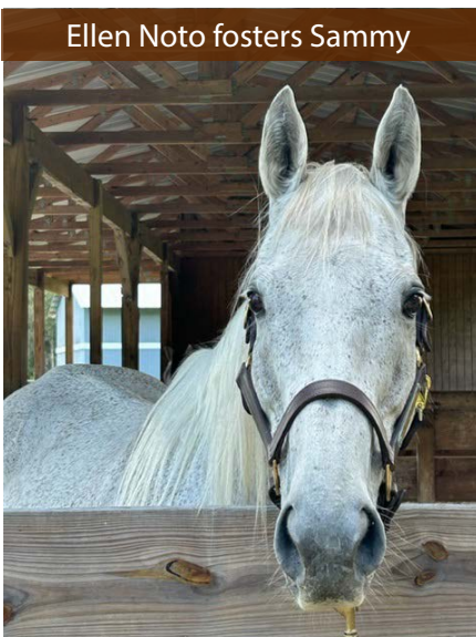
Ellen Noto fosters Sammy