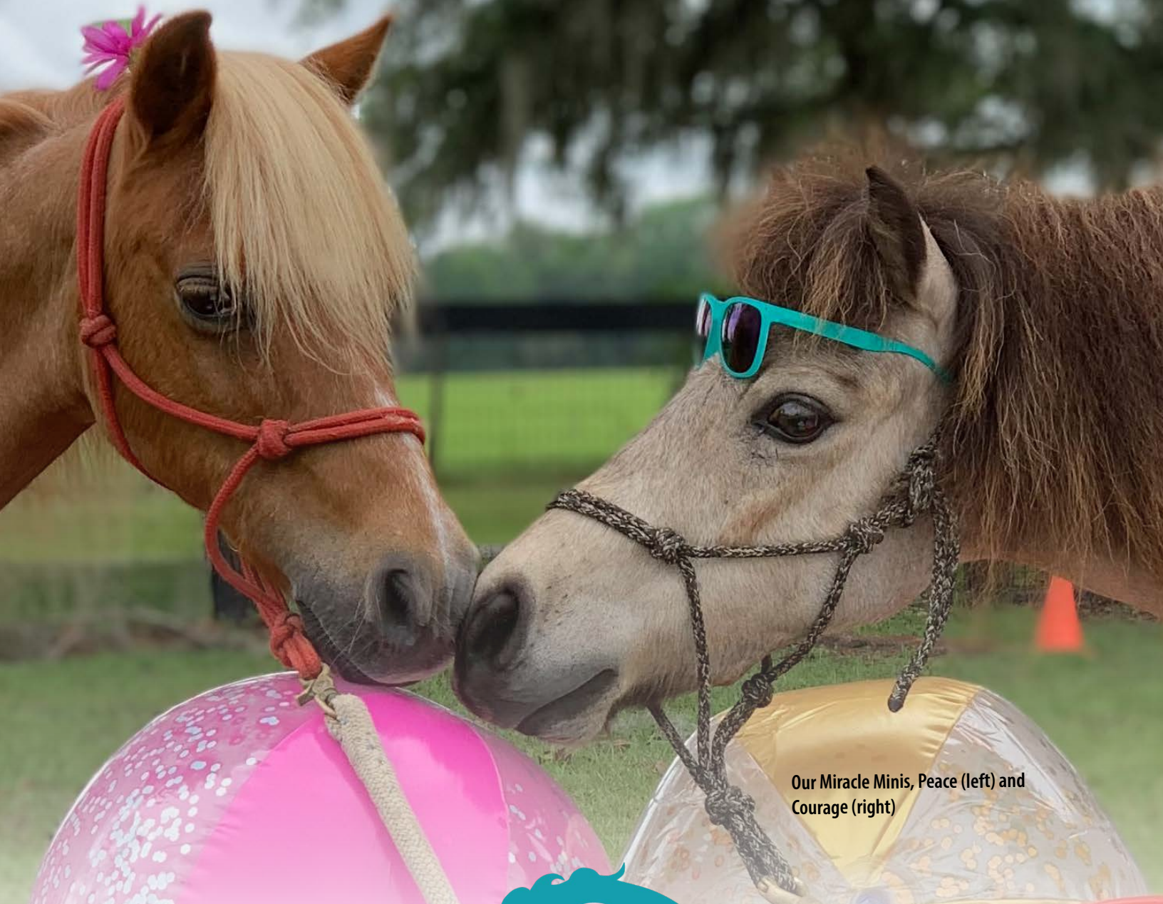
Our Miracle Minis, Peace (left) and Courage (right)